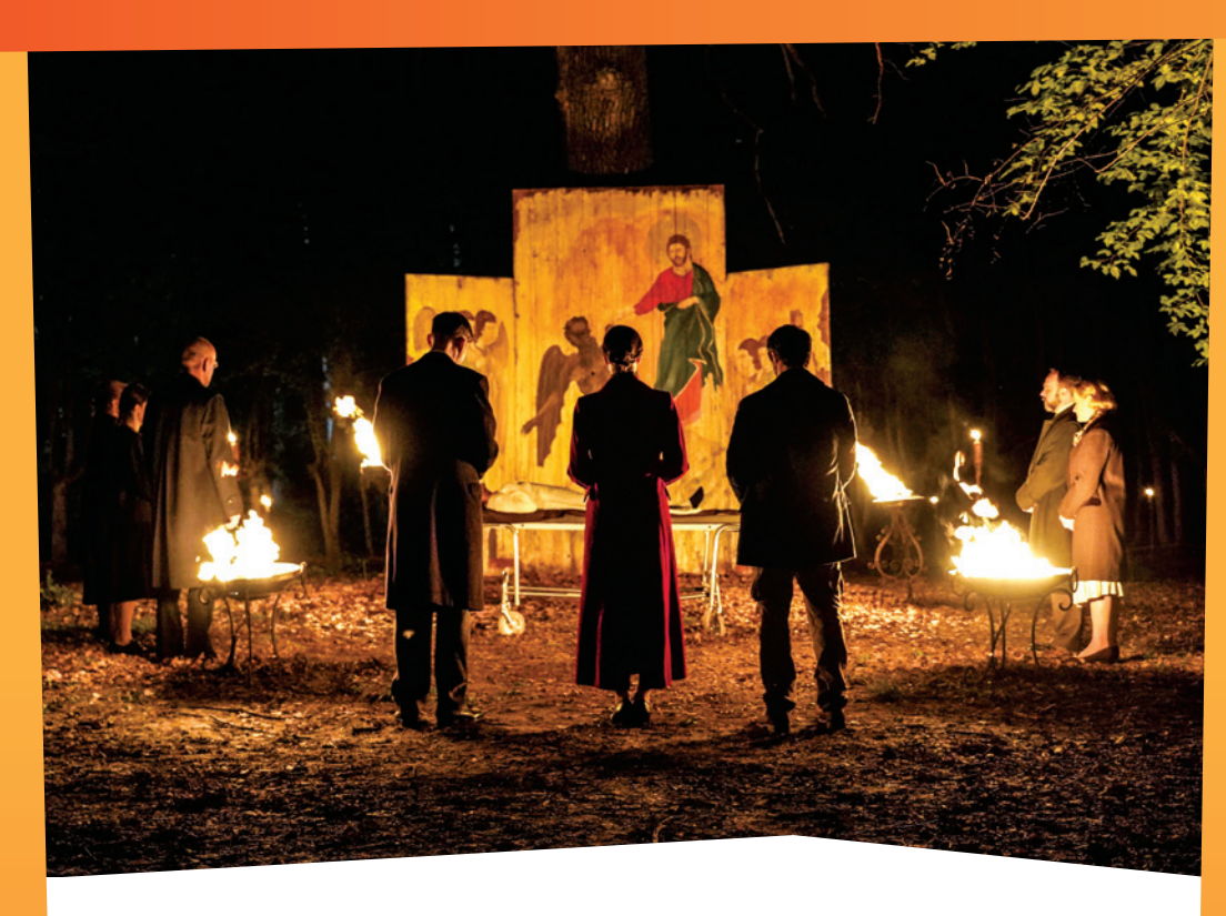
INFO | Italy | 2019 DCP | 2k | HD | Audio 5.1 | 107' | Italian GENRE Horror